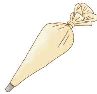
Icing (or melted chocolate)