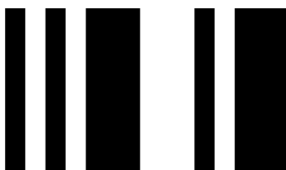
Barcode – IR learn turn left