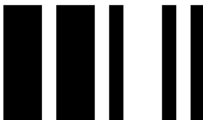
Barcode – IR learn turn right