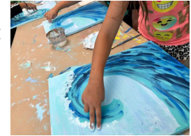
Wave finger painting

Prepare painting stations for groups of two to four students. Squirt blue, green, and white paint onto a paper plate for each group. Provide a piece of construction paper for each student. Have extra paper plates ready for students to have their own mixing plate if necessary. Provide paper towel for each student to clean their fingers as they paint.