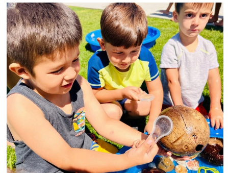
Students explore items floating in the ocean sensory pool.

Let your students have plenty of time to explore, enjoy, and play in the ocean sensory bins or baby pools.