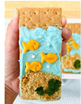
“Graham Cracker Beach” snack art

At each table, set out paper plates, plastic knives, graham crackers, blue frosting, and goldfish crackers, gummy sharks, or teddy grahams. Lettuce can be used for seaweed.