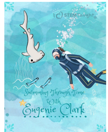
Eugenie Clark story.

5. Discuss the story with your students, following the discussion prompts printed underneath the story text.